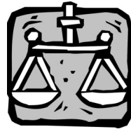
. . .and His justice is perfect and fair

Because God is motivated by His Love. . .