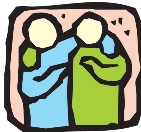
4 Share the "Good News"