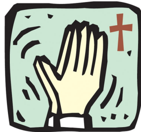
2 Pray to God