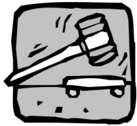
God must judge all sin. . .

■ The Lord, the Lord God, compassionate and gracious, slow to anger, and abounding in loving-kindness and truth; who keeps lovingkindness for thousands, who forgives iniquity, transgressions and sin; yet He will by no means leave the guilty unpunished. . . Exodus 34:6-7