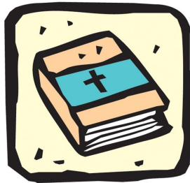
1 Read Your Bible