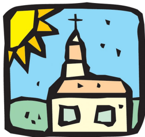
3 Join a good church